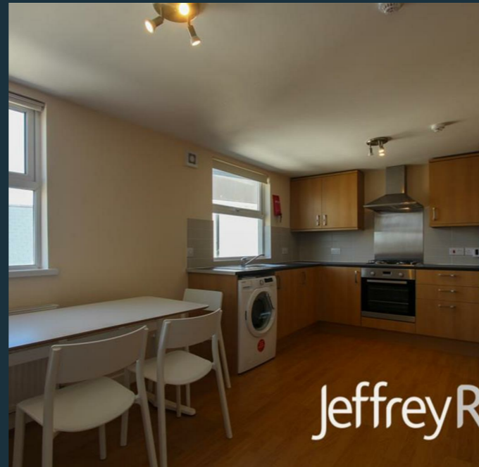
Duplex Apartment, Richmond Road, Roath