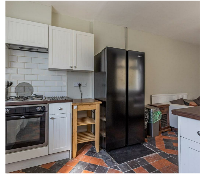
Donald Street, Roath