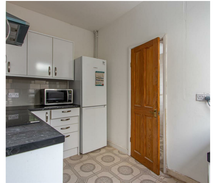
Mackintosh Place, Roath CF24 4RP