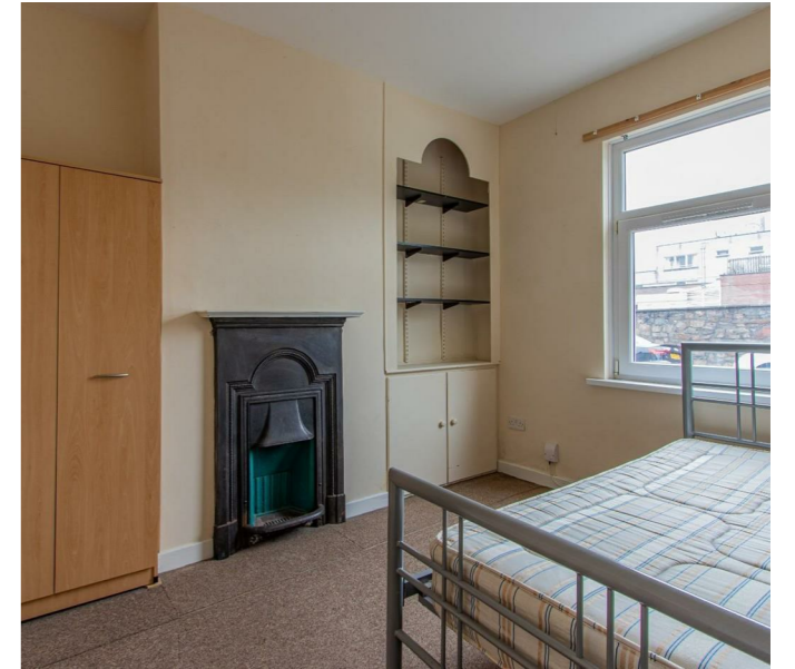
Daniel Street, Roath