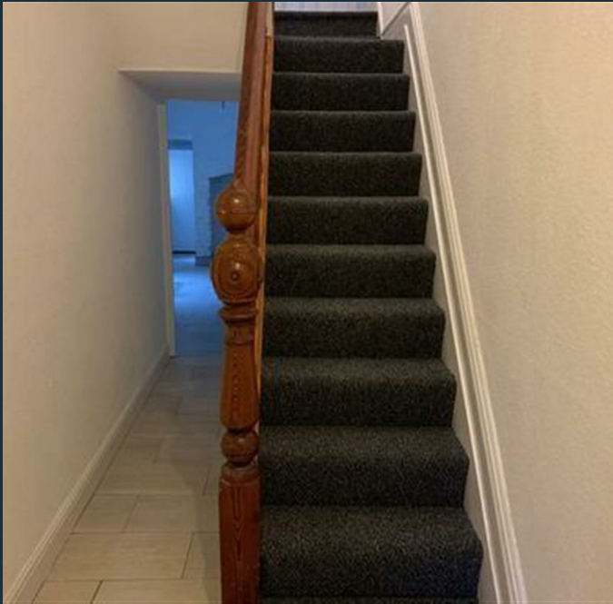
Mackintosh Place, Roath