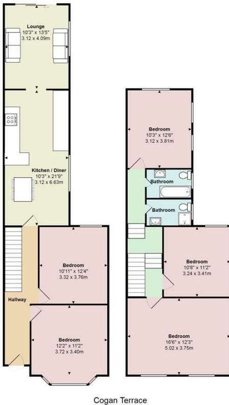
Total Area: 1377 ft² ... 127.9 m²