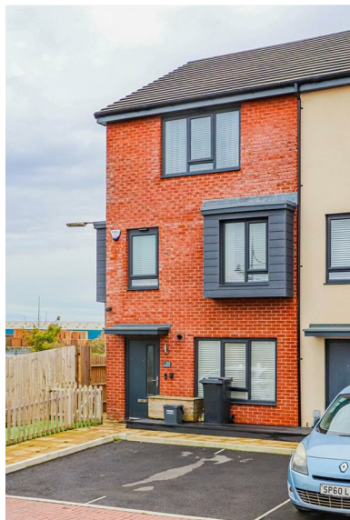
Ffordd Darwin, Barry, CF63 4RS