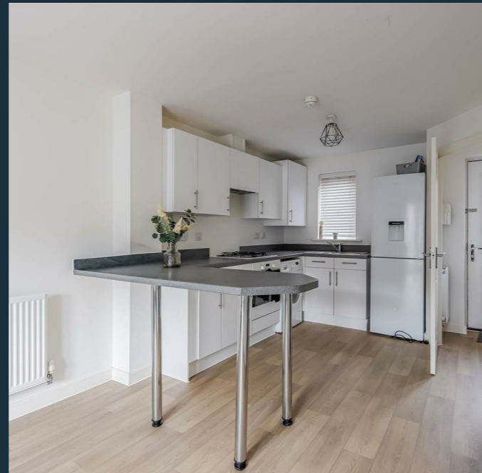
Ffordd Y Dociau, Barry