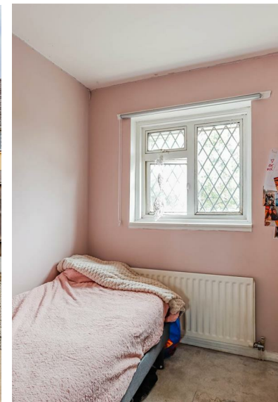
Florence Avenue, Barry, CF62 9XH