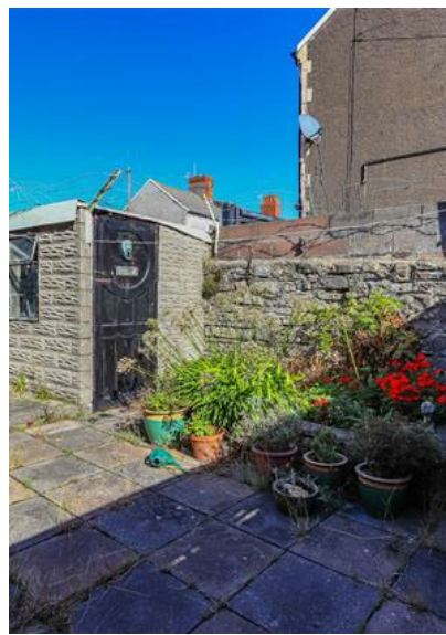
George Street, Barry, CF63 4NL