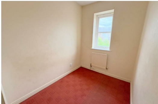
1 St. Margarets Road, Prestwich, Manchester, M25 2QB