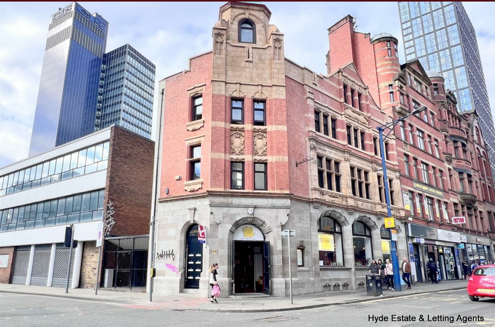
Hyde Estate & Letting Agents