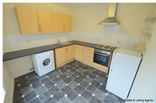
Hyde Estate & Letting Agents