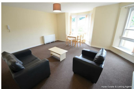
Hyde Estate & Letting Agents