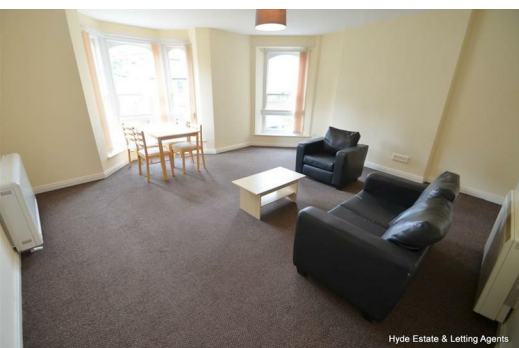
Hyde Estate & Letting Agents

Please note successful applicants are required to collect the keys from our office in Prestwich, Manchester.