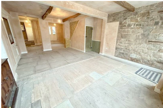
1 St. Margarets Road, Prestwich, Manchester, M25 2QB