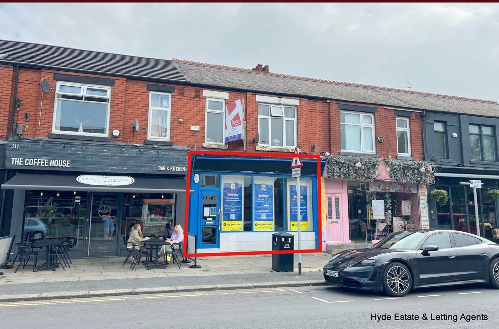
Hyde Estate & Letting Agents