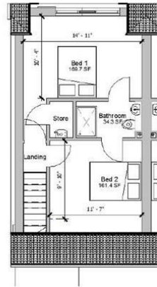
Second Floor Sales 1 : 100