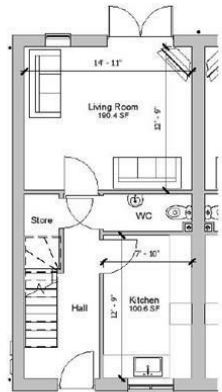
Ground Floor Sales 1 : 100