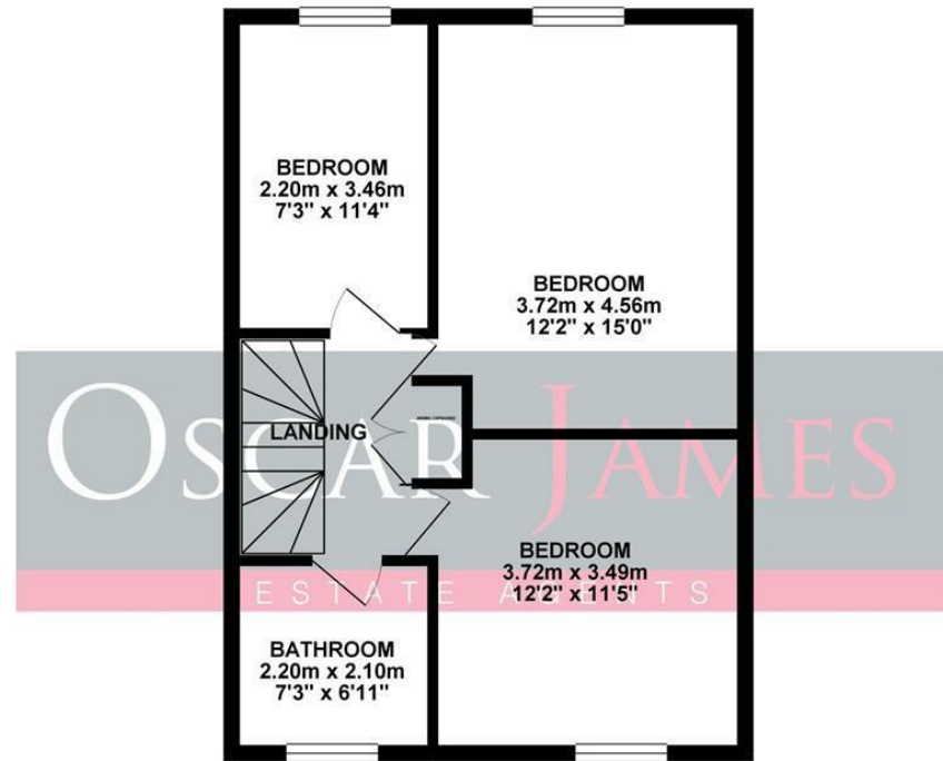
1ST FLOOR 45.18 sq. m. ( 486.31 sq. ft. )