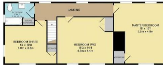
FIRST FLOOR APPROX. FLOOR AREA 902 SQ.FT. (83.8 SQ.M.)

TOTAL APPROX. FLOOR AREA 1938 SQ.FT. (179.9 SQ.M.) While every attempt has been made to ensure the accuracy of the floor plan contained here, measurements of rooms, windows, doors and any other items are approximate and no responsibility is taken for any errors, omissions or misstatements. This plan is for illustrative purposes only and should be used as such by any prospective purchaser. The services, systems and appliances shown have not been ordered and no guarantee as to their availability or otherwise can be given. Made with Metaphor 02/14