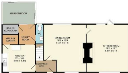
GROUND FLOOR APPROX. FLOOR AREA 1035 SQ.FT. (96.1 SQ.M.)