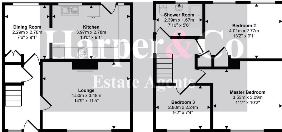
Ground Floor Approx 41 sq m / 443 sq ft