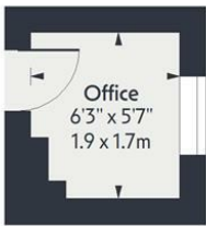
Upper Ground Floor Floor Area 33 Sq Ft - 3.07 Sq M