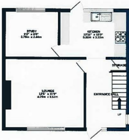
GROUND FLOOR 401 sq ft (37.2 sq m) approx.