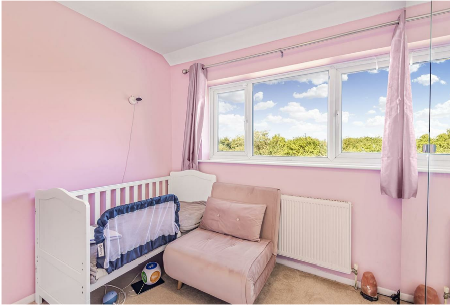
Bedroom 3 7'3 x 5'2 (2.21m x 1.57m)

145 Ashford Avenue, Hayes, Middlesex UB4 0ND