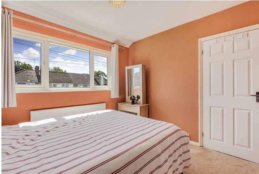
Bedroom 2 10'6 x 9' (3.20m x 2.74m)

145 Ashford Avenue, Hayes, Middlesex UB4 0ND