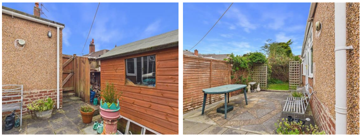
To The Front of The Property