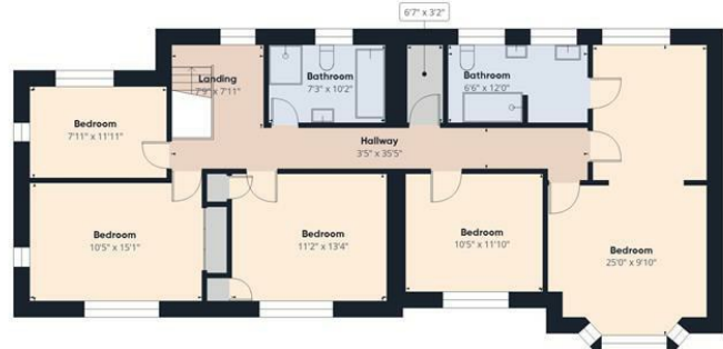
Floor 3 Building 1