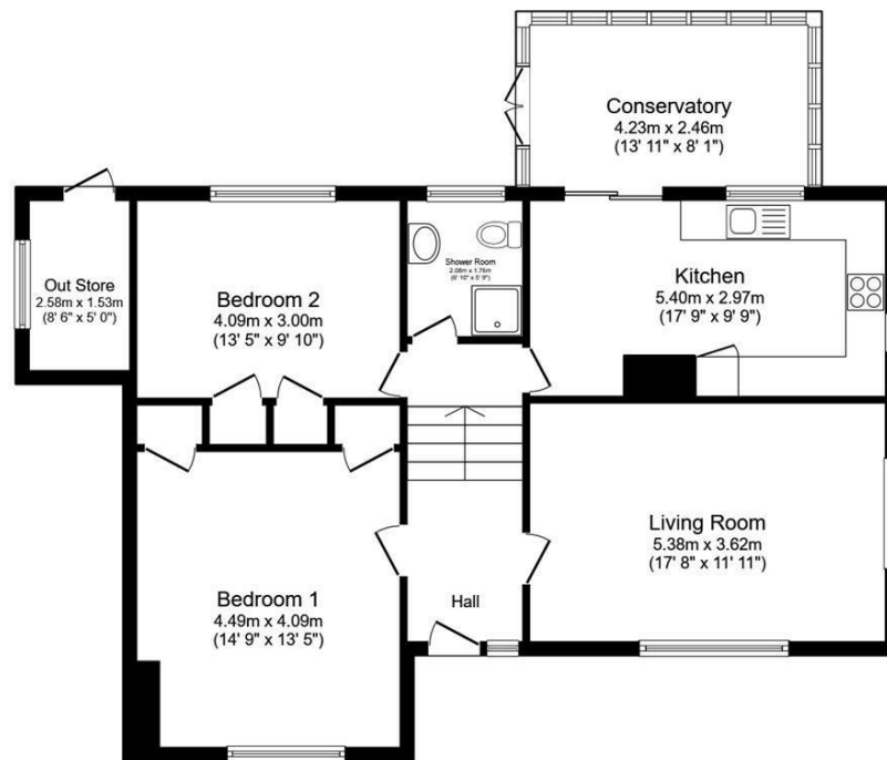
Floor Plan Floor area 97.9 sq.m. (1,054 sq.ft.)

Total floor area: 97.9 sq.m. (1,054 sq.ft.)