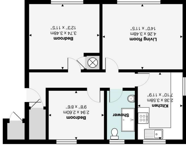
3, Burdett House, Burdett Road, Jarvis Brook, TN6 2EY

All measurements are approximate and for display purposes only