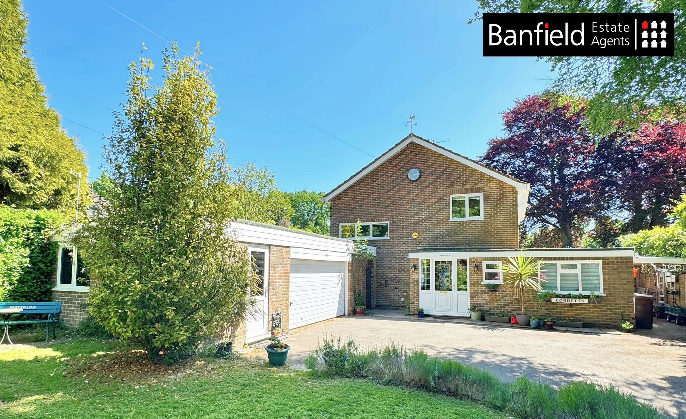
Cobbetts Spout Hill Crowborough, TN6 3QX Price Guide £695,000