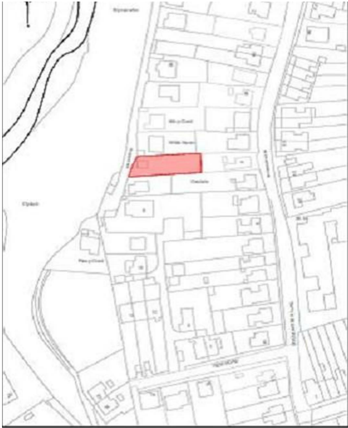
Block plan showing extent of works Scale - 1:1250