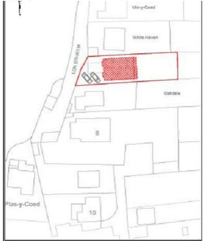
Block plan showing extent of works Scale - 1:500

WARNING:- THIS MAY BE A REDUCED SIZE PRINT, CHECK SCALE BELOW