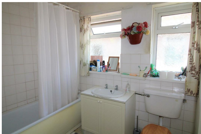
Bathroom 7'4" x 9'11" (2.24 x 3.03)

Fitted with panel bath with shower over, wash hand basin, low level w/c, window to side and radiator.