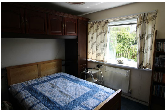
Bedroom 2 9'8" x 9'11" (2.97 x 3.03)

Fitted wardrobes with overhead units, window to rear and radiator.