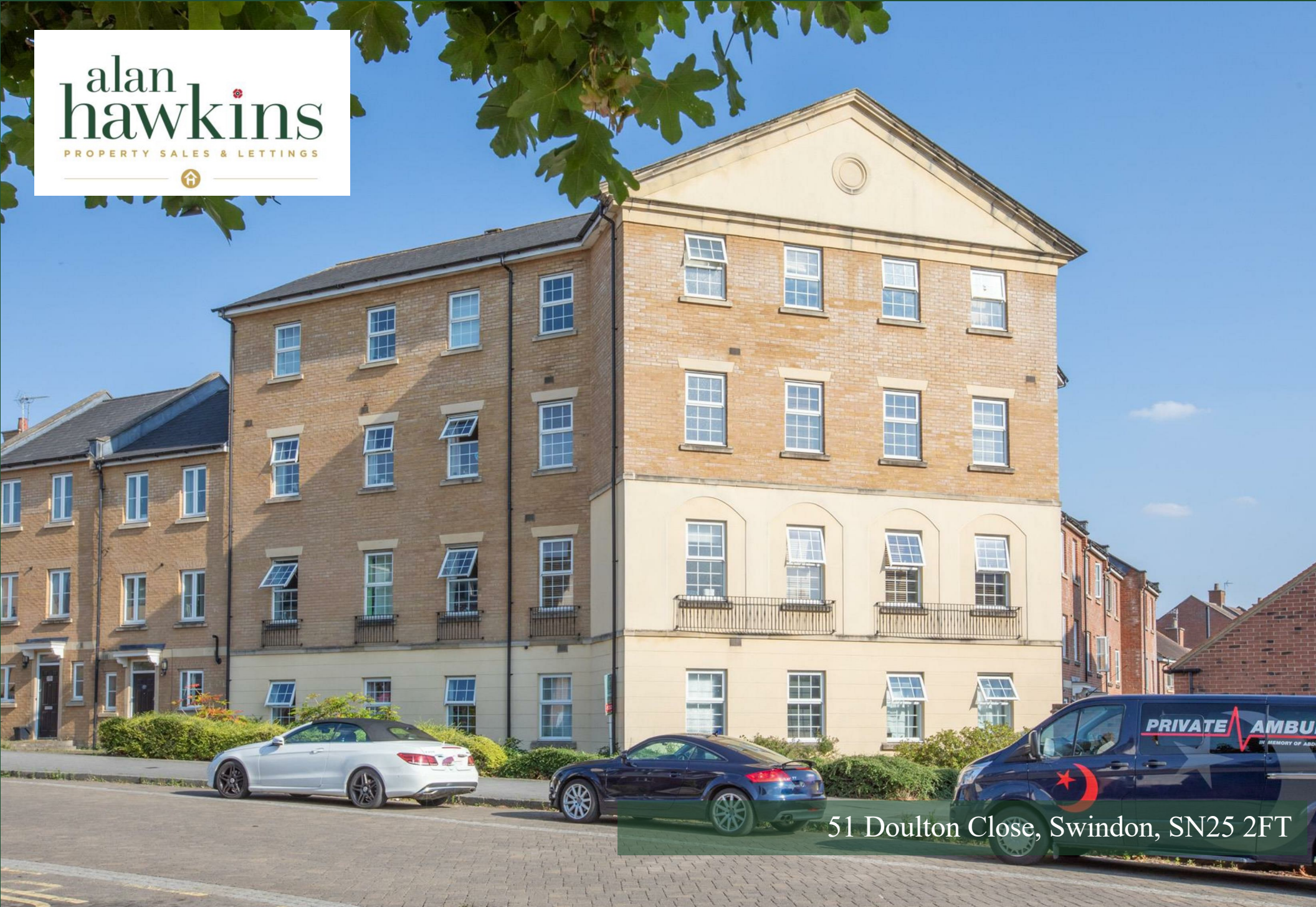
51 Doulton Close, Swindon, SN25 2FT