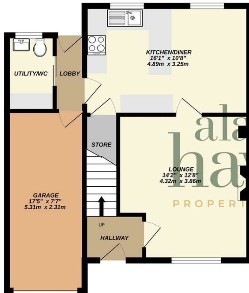
1ST FLOOR 515 sq.ft. (47.8 sq.m.) approx.