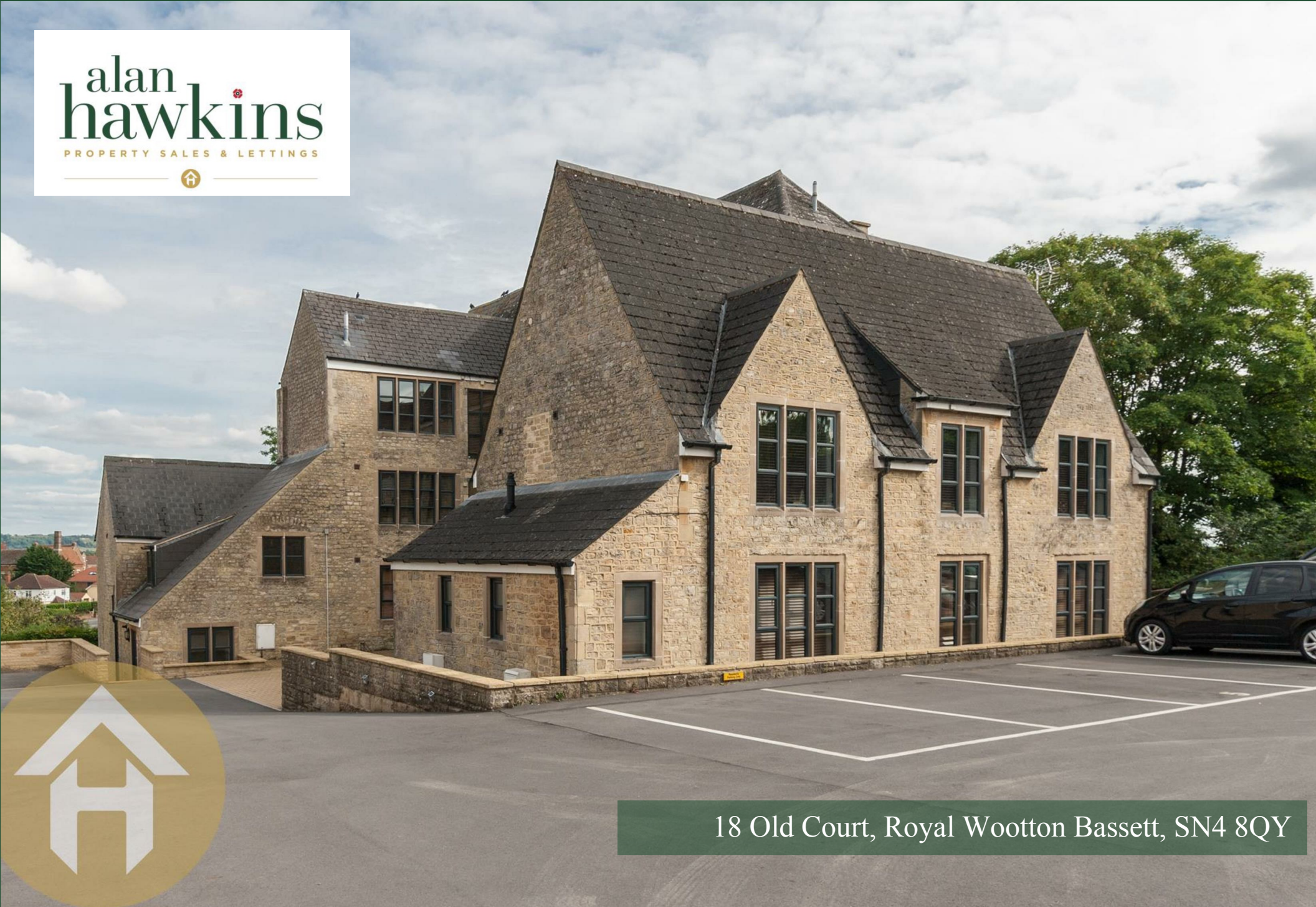
18 Old Court, Royal Wootton Bassett, SN4 8QY