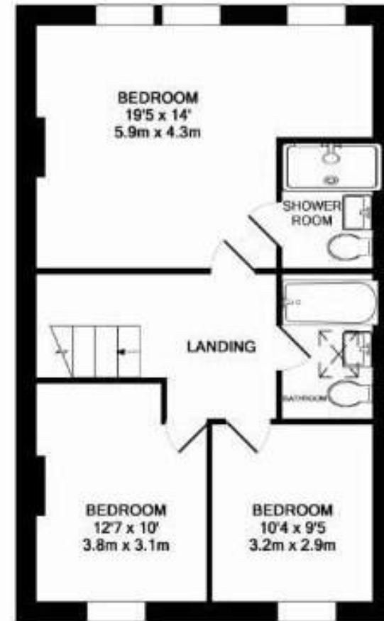
1ST FLOOR APPROX. FLOOR AREA 626 SQ.FT. (58.2 SQ.M.)

TOTAL APPROX FLOOR AREA 172M2 EQUATING TO 1,850 SQFT