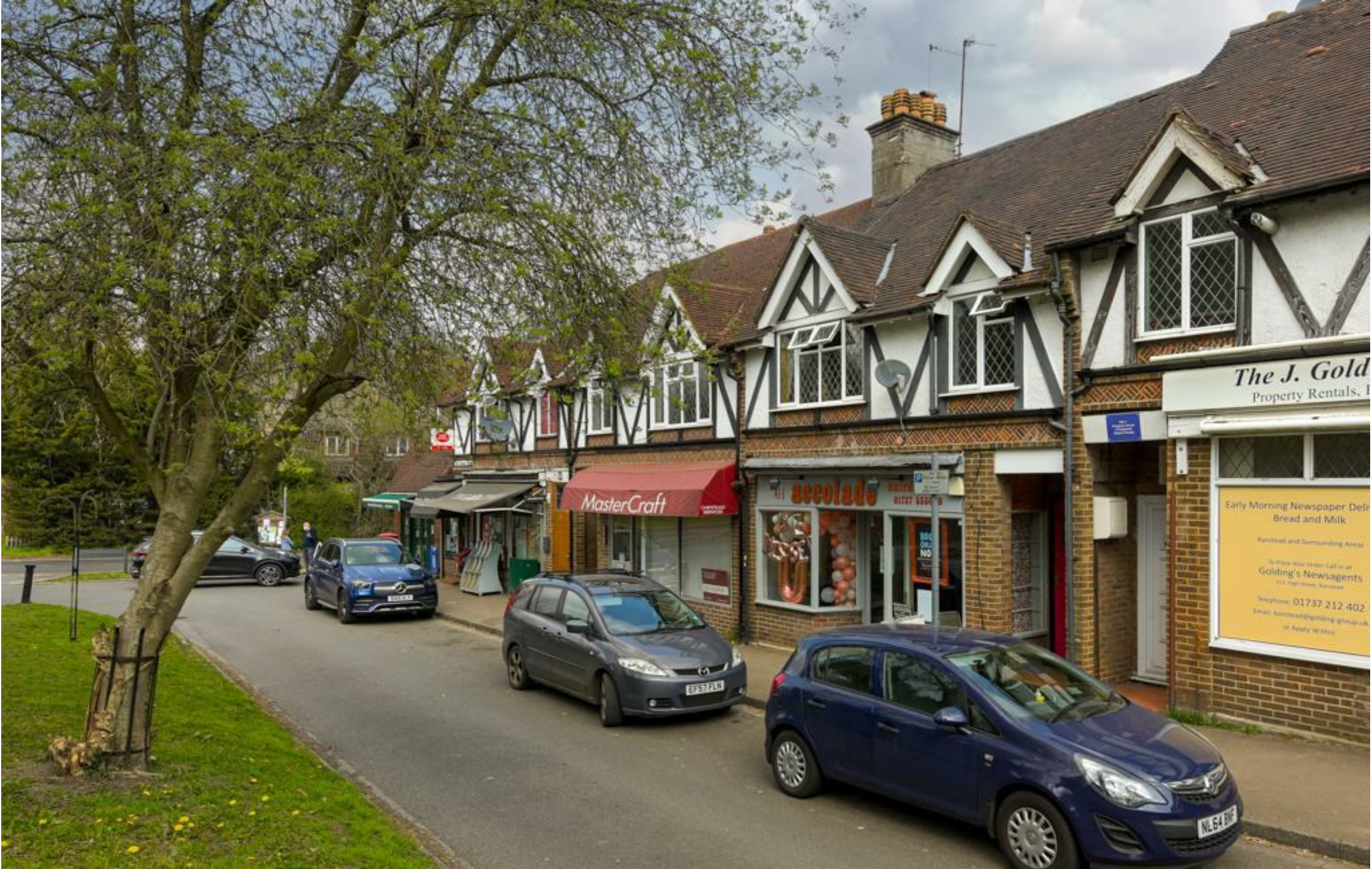
Chipstead Station Parade, Coulsdon