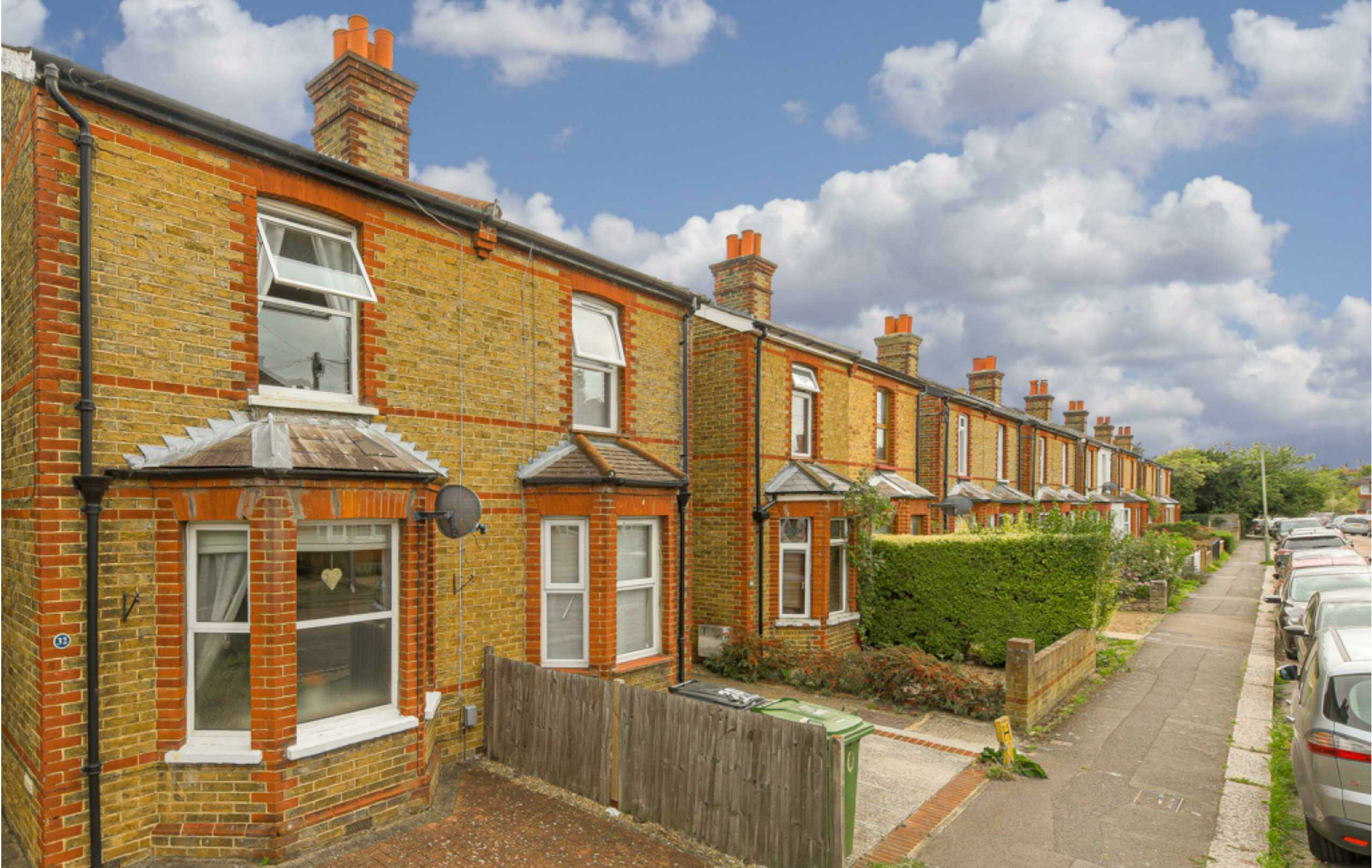
Upper Court Road, Epsom