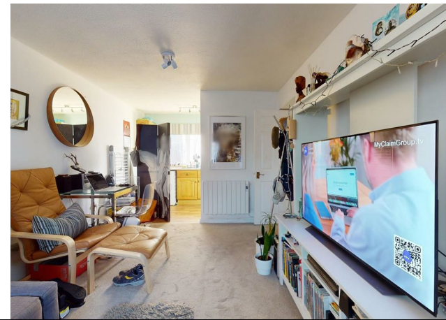
Flat 41, Barrington Court Winton