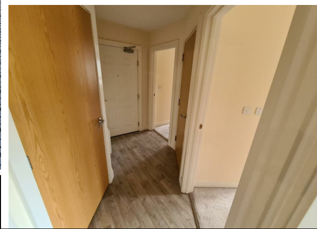
Flat 11 Selway House Frome