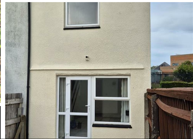
Pinkhams Twist, Whitchurch