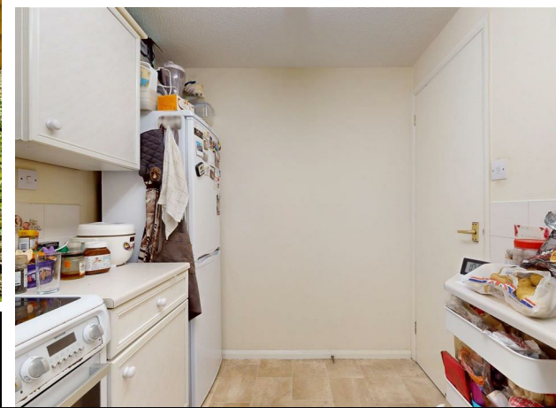
Langton Way, St. Annes Park