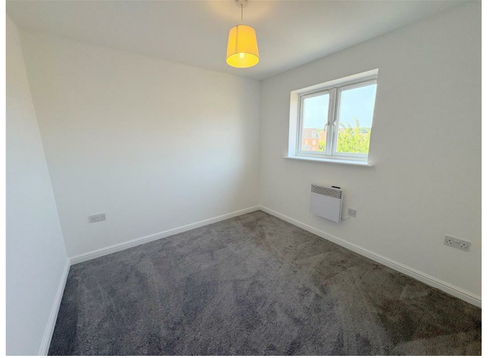
Bedroom Two 9'3" x 9'3" (2.84 x 2.84)

Skimmed ceiling, skimmed walls, fitted carpet, wall mounted electric heater, uPVC double glazed window to the rear.