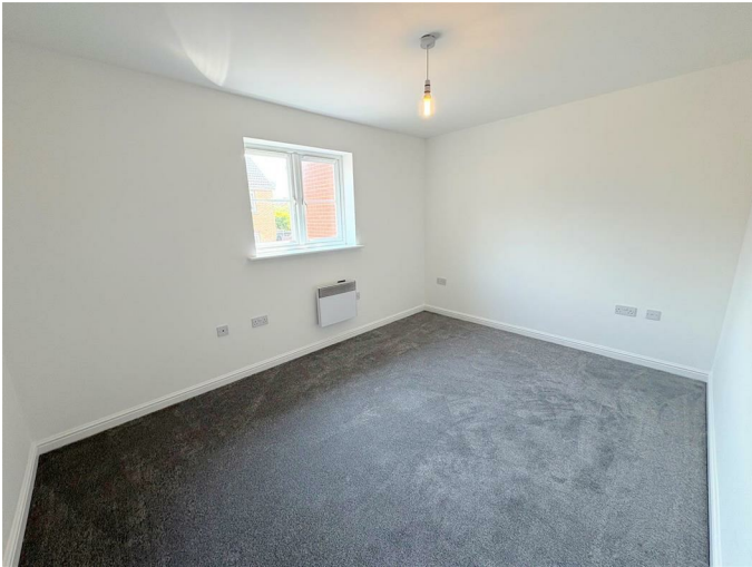
Bedroom One 12'11" x 9'6" (3.94 x 2.92)

Skimmed ceiling, skimmed walls, fitted carpet, wall mounted electric heater, uPVC double glazed window to the front.