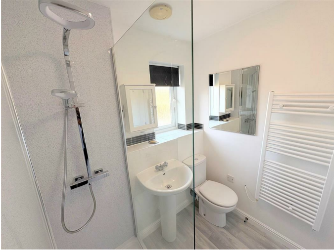
Shower Room 6'2" x 5'6" (1.88 x 1.69)

Skimmed ceiling, skimmed walls with PVC panels inside the shower and tiled splash back over the wash hand basin, wood effect vinyl flooring, white ceramic heated towel rail, three piece suite comprising a double shower cubicle with dual rainfall shower and glass privacy screen, pedestal wash hand basin and a low level W.C., wall mounted mirrored vanity unit, uPVC double glazed window with obscured glass to the rear.