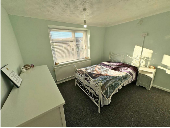
Bedroom One 11'4" x 11'0" (3.47 x 3.36)

Textured and coved ceiling, skimmed walls, fitted carpet, radiator, built-in storage cupboard, uPVC double glazed window to the front.