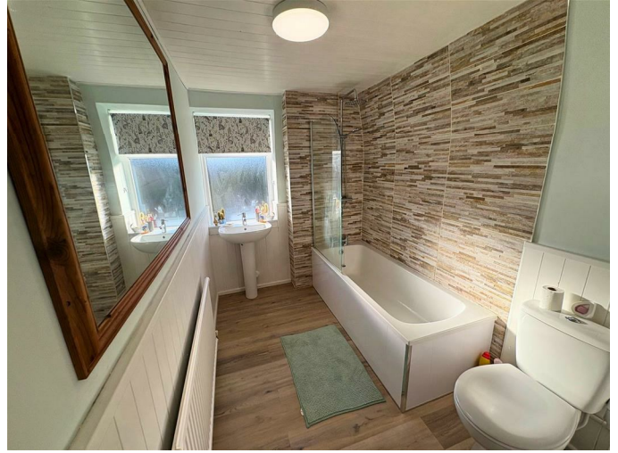
Bathroom 11'4" x 6'0" (3.47 x 1.85)

Tongue and groove ceiling, skimmed and tiled walls, wood effect vinyl flooring, radiator, over stairs storage cupboard, three piece suite comprising a panel bath with shower over and glass privacy screen, pedestal wash hand basin and a low level W.C., uPVC double glazed window with obscured glass to the rear.