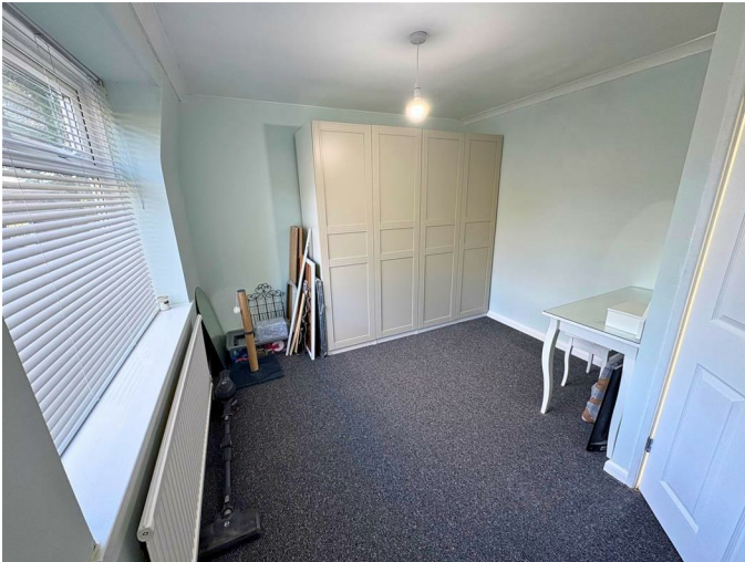
Bedroom Two 11'6" x 9'10" (3.52 x 3)

Skimmed and coved ceiling, skimmed walls, fitted carpet, radiator, uPVC double glazed window to the front.