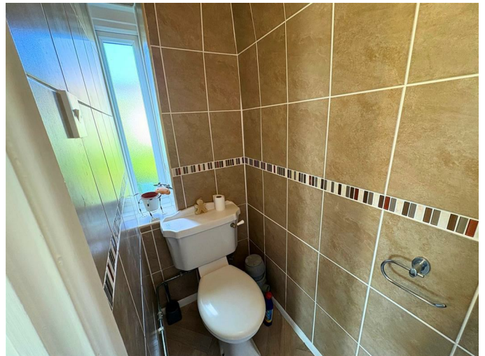
W.C 5'6" x 2'7" (1.7 x 0.8)

Textured ceiling, tiled walls, wood effect vinyl flooring, radiator, low level W.C, uPVC double glazed window with obscured glass to the side.