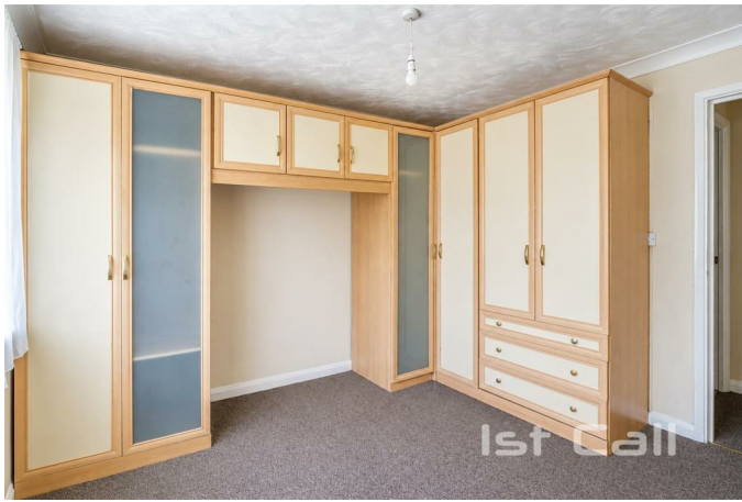
Bedroom 2 10'11 x 7' (3.33m x 2.13m)