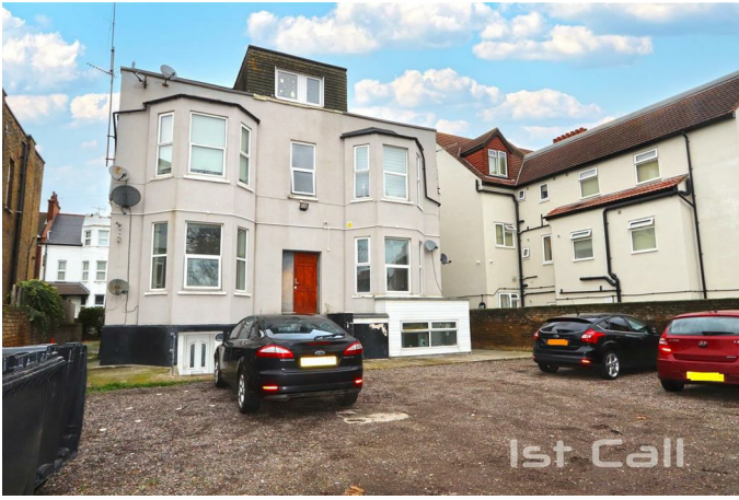
Allocated off street parking space in residents car park to rear accessed via Wesley Road...