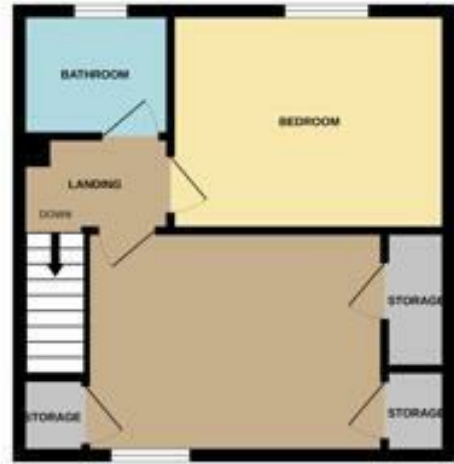
TOTAL FLOOR AREA : 859 sq ft (79.9 sq.m.) approx.

While every attempt has been made to ensure the accuracy of the floorplan contained here, measurements of doors, windows, rooms and any other items are approximate and no responsibility is taken for any error, omission or mis-statement. This plan is for illustrative purposes only and should be used as such by any prospective purchaser. The services, systems and appliances shown have not been tested and no guarantee as to their operability or efficiency can be given. Made with Blueprints (2025)