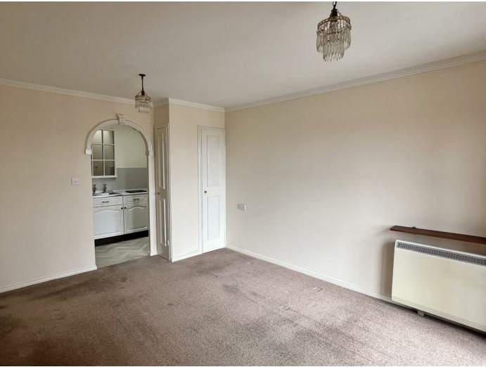
Bedroom: 11'5" x 9'0" (3.50m x 2.75m )