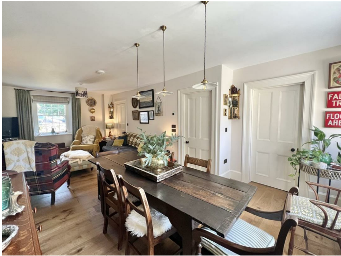
Reception Room Two Snug 11'10" x 10'0" (3.63m x 3.05m )