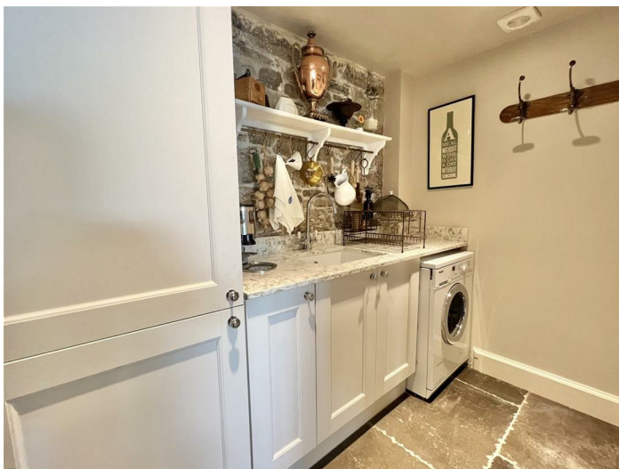
The seamless flow flag stone slate flooring leads into the the utility boot room with part exposed stone wall. Kitchen work surface and splash back incorporating sink and mixer tap, with cabinet storage to the side and beneath. Space and plumbing for white good appliances.