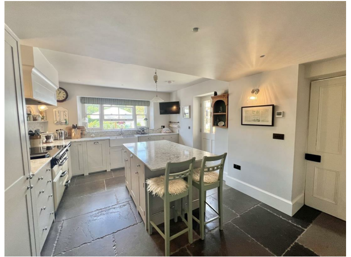
Extended by the current owners, creating this bespoke "Neptune" kitchen and utility room. This British craftsmanship's firm are celebrated for their timeless, country-to-contemporary heritage high end finished. It has been thoughtfully designed and laid out and offers ample floor and wall cabinets complemented with Neptune kitchen wall lights, stone work surfaces incorporating a Belfast sink with "Perrin & Rowe" Mixer Tap. Double glazed sash windows above enjoy the fabulous sunny aspect rear garden. Flagstone slate flooring. High end integrated Bosch fridge freezer, dishwasher, a Rangemaster Elan with Induction hob and hot plate, with discreetly hidden extractor with lighting above. A central island incorporating further draws, cabinets, integrated waste bin plus open display shelving. Tucked back in the corner are double doors opening to a larder cupboard with draws beneath.