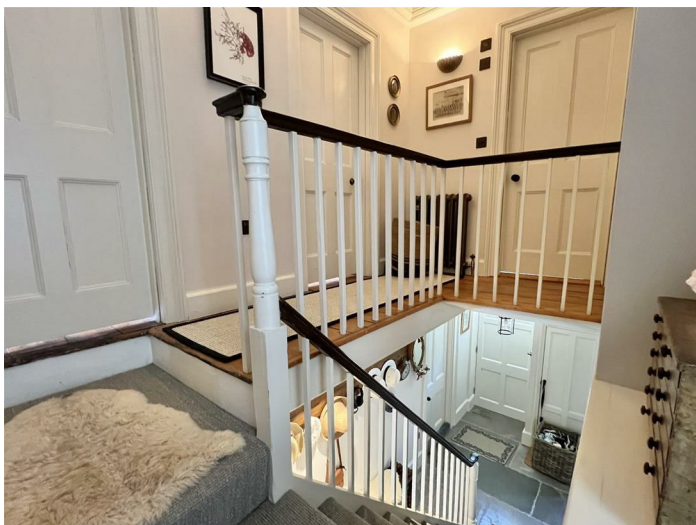
Carpeted staircase leads to the landing, with original and restored exposed floorboards. Doors to all three double bedrooms of which each offers matching reclaimed cast iron feature fireplaces, elegantly appointed family bathroom and separate shower room.