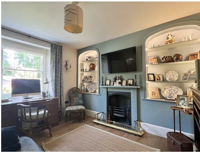
This cosy snug is situated to the front. The focal point is a Georgian cast iron fireplace set onto a slate hearth with mantle surround, complemented by arched and lit display shelving to both sides. A restored sash window enjoying an outlook over the garden.