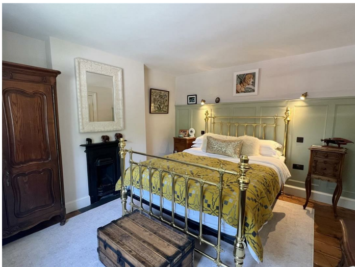
The third double bedroom. Impeccably finished to a high standard with the exposed restored flooring continuing through. Period radiator beneath the sash window. Open fireplace surround with slate hearth. Wood panelling with "Pooky" over bed reading lights.

A welcoming frontage enclosed by the granite and stone built wall. To the rear enjoys a fabulous sunny aspect private rear garden which has been thoughtfully designed, incorporating beautifully stocked areas with an abundance of shrubbery and plants. A flag stone tile paved raised patio is ideal for alfresco dining and entertaining. Steps and pathway with pebble stone base leads to further raised planter borders and down to an additional seating area and gateway to the parking. The parking area incorporates one vehicle and could be developed as a garage subject to any necessary planning permission. Further off road parking is permitted directly outside the property. There is also a generous sized storage facility.