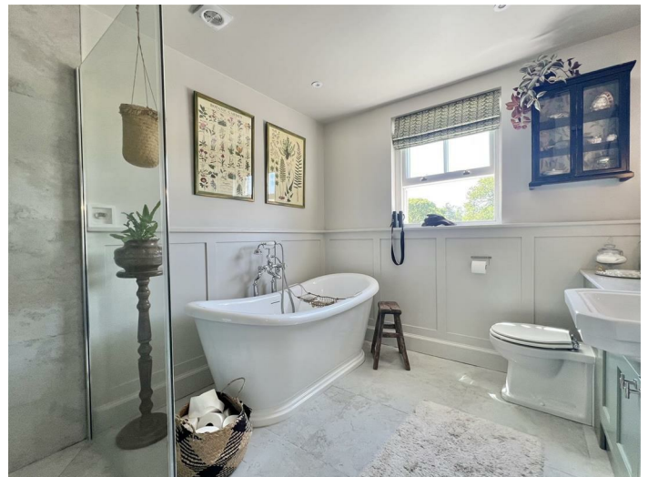
Located to the rear from its elevated position, enjoys fabulous views from a double glazed sash window. elegantly appointed and finished with tiled flooring, and shower area. A Roper Rhodes double ended free standing bath with mixer tap and separate shower head attachment. Low level WC and hand basin set into a vanity storage beneath and marble display top. Door into shower cubicle with rain effect ceiling mounted shower head and separate attachments. Discreetly hidden behind the door a period styled heated towel rail.