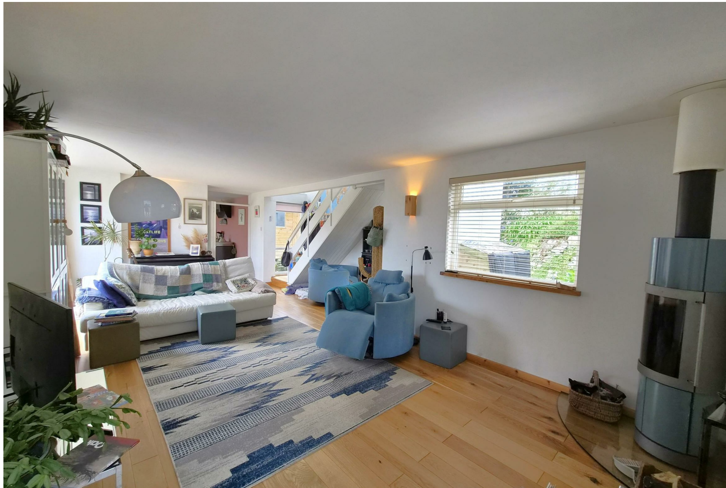
Fig Tree House Woodland Avenue, Tywardreath, Par, PL24 2PL