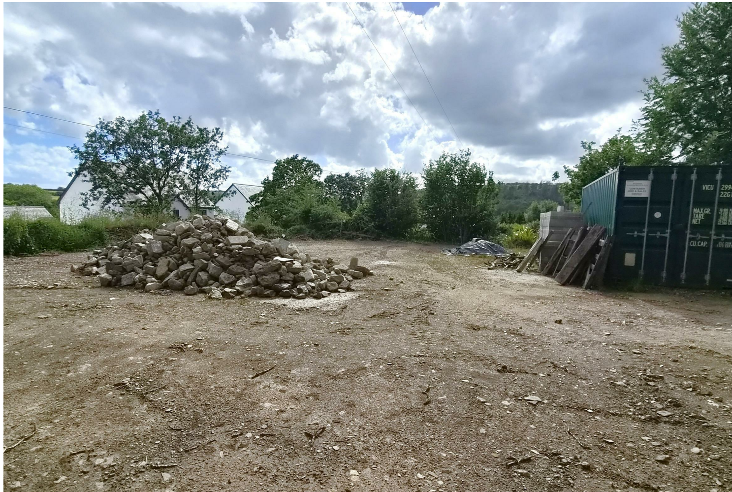
Land East of Hillborough, Porcupine, Porcupine, Par, PL24 2RP