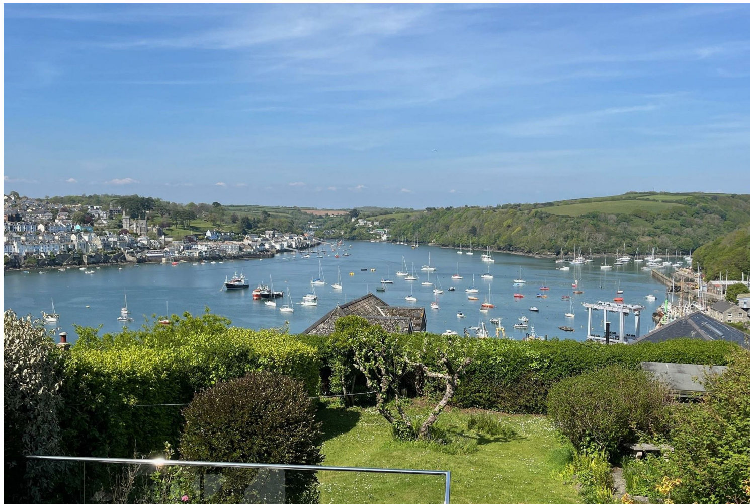
Rosebank, 20 St. Saviours Hill, Polruan, Cornwall, PL23 1PR