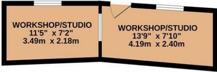
TOTAL FLOOR AREA : 1100 sq.ft. (102.2 sq.m.) approx.

Whilst every attempt has been made to ensure the accuracy of the floorplan contained here, measurements of doors, windows, rooms and any other items are approximate and no responsibility is taken for any error, omission or mis-statement. This plan is for illustrative purposes only and should be used as such by any prospective purchaser. The services, systems and appliances shown have not been tested and no guarantee as to their operability or efficiency can be given. Made with Metropix ©2026